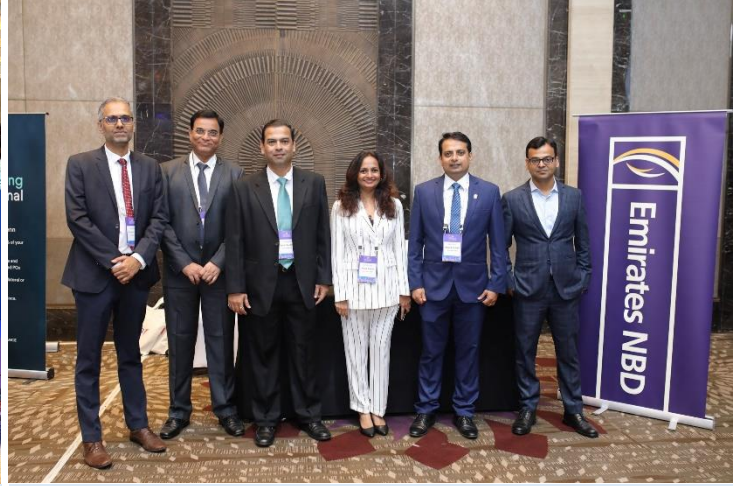
Emirates NBD Team at GTR 2024, Mumbai, India